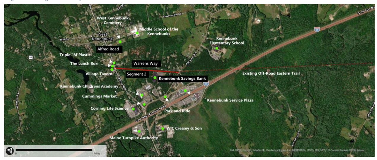
Figure 4-6. Segment 2 Project Area

Creating these two off-road segments for the outer portion of this proposed 11-mile corridor connects communities directly to affordable transportation options. These multi-use paths will be ADA compliant and designed for all users in mind. The Eastern Trail promotes long-term economic opportunities through an equitable lens by providing expanded transportation options.