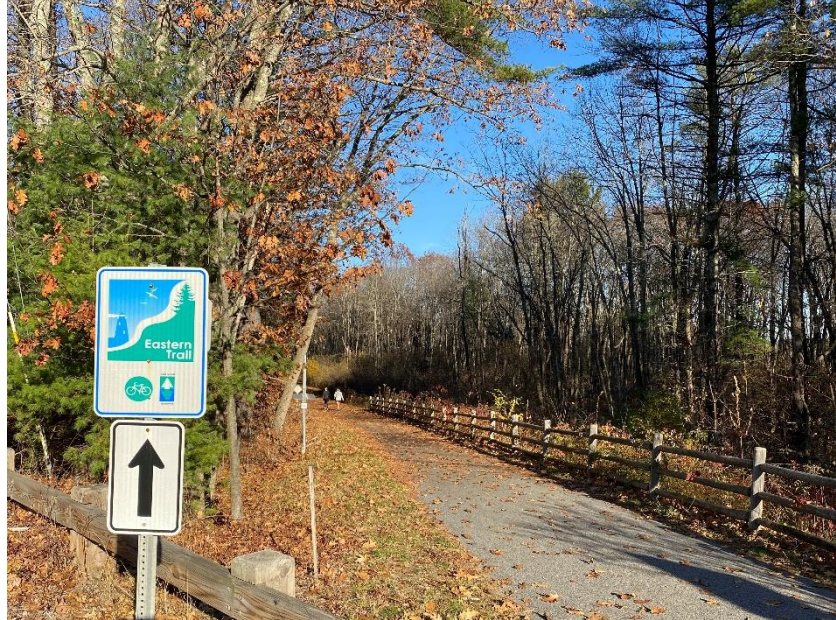
Figure 4-8. Existing Eastern Trail looking north at Alewive Road in Kennebunk

The Eastern Trail has a colocation agreement to be within the Unitil/Granite State Gas Transmission corridor and Unitil sees the construction of the trail along their corridor as a benefit as it will allow them to better maintain their corridor with improved access. Unitil and the Eastern Trail have been good partners and stewards of the environment and share the commitment to maintaining the state of good repair for these two segments and for the Eastern Trail as a whole.