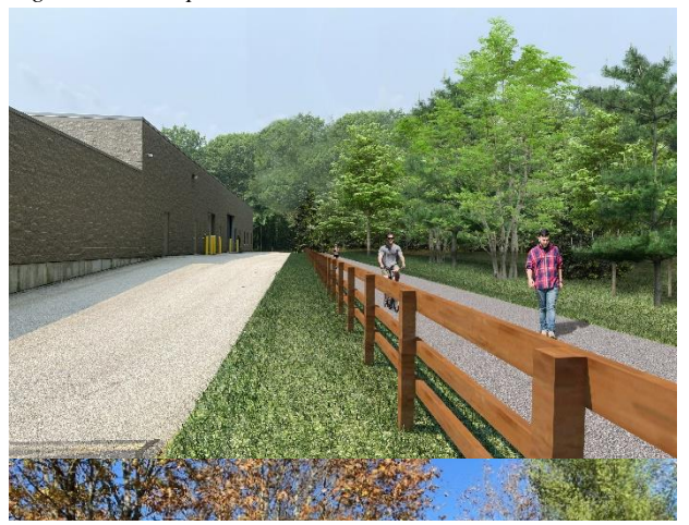
Figure 4-113. Proposed Eastern Trai - North Berwick